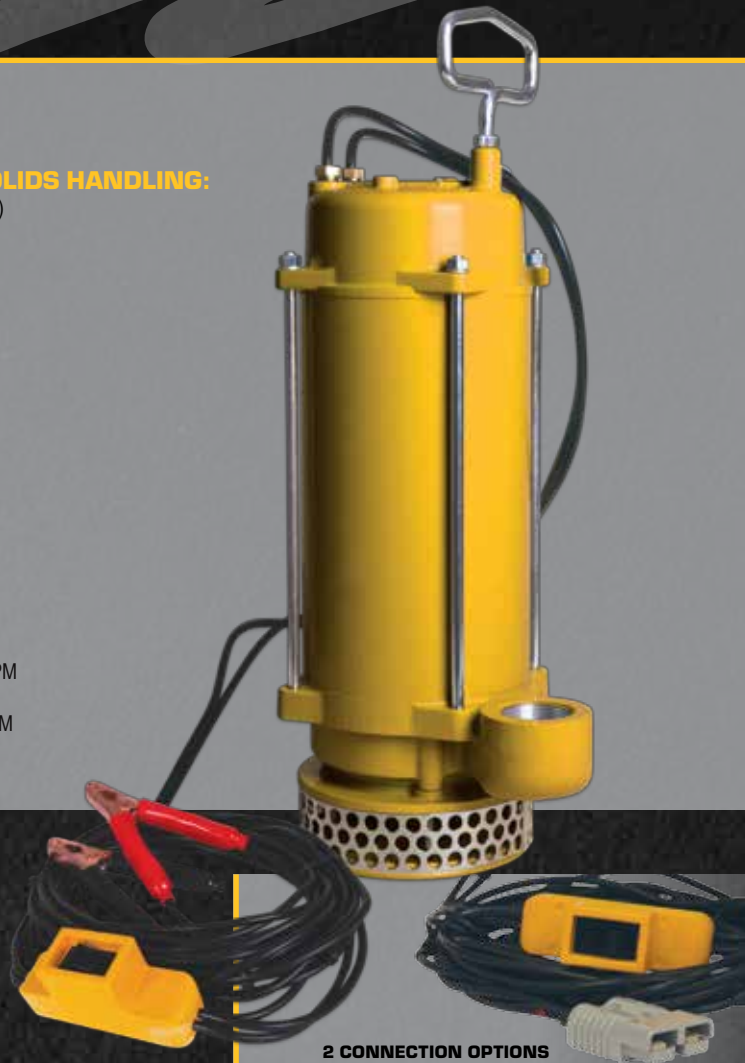
2 CONNECTION OPTIONS